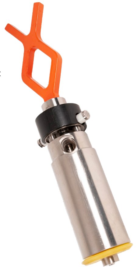
ClampOn Subsea Flow Temperature Monitor