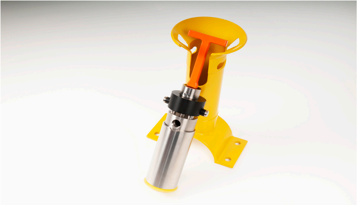
Subsea Flow Temperature Monitor